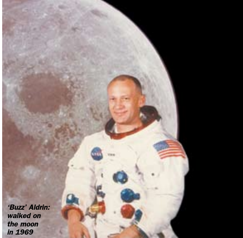
'Buzz' Aldrin: walked on the moon in 1969