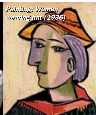
Painting: Woman wearing hat (1936)

Remedios Cipriano de la Santisima Trinidad Ruiz Picasso! When Pablo was a young boy, he was interested in Art and had lessons. He spent his free time drawing. He could draw quite well but not like Picasso. Today, he's an Art teacher.